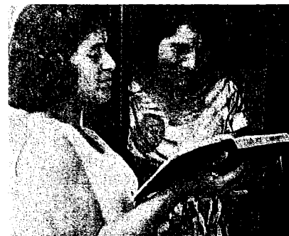
Telling the good news

Christmas really is not gifts, programs, or family gatherings--it is rather a great and marvelous holy excitement in the spiritual realm in heaven and earth. No wonder the angels were on their "tip-toes" to see it. It will be exciting to you too--if you let God send you--anywhere--or at least to somewhere.